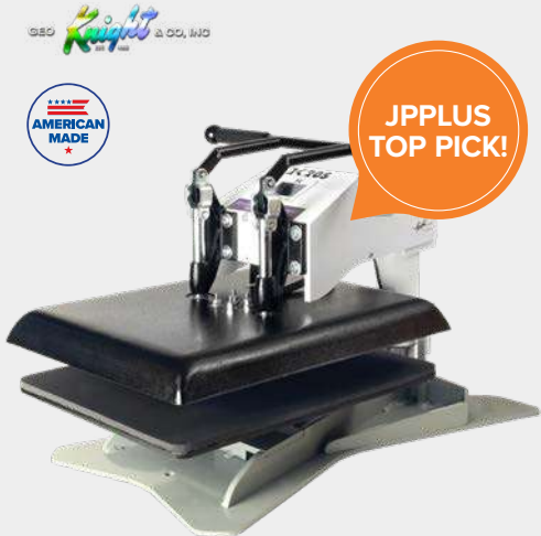
DK20S 16” x 20”

BEST SELLER DURABLE & RELIABLE EVEN PRESSURE & HEATING