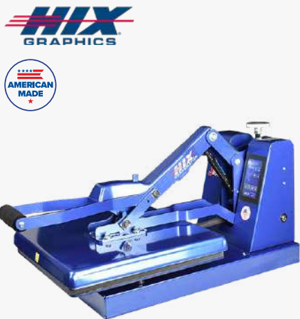
Evo Pro 15" x 15" ENTRY LEVEL AUTO RELEASE DIGITAL CONTROLS