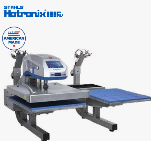
Dual Air Fusion IQ 16" x 20" TWO PLATENS IN ONE MACHINE DURABLE & RELIABLE LASER ALIGNMENT SYSTEM