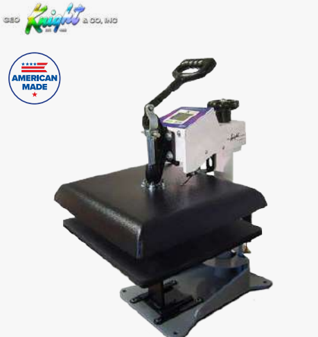
DC16 14” x 16”

ENTRY LEVEL DURABLE & RELIABLE EVEN PRESSURE & HEATING