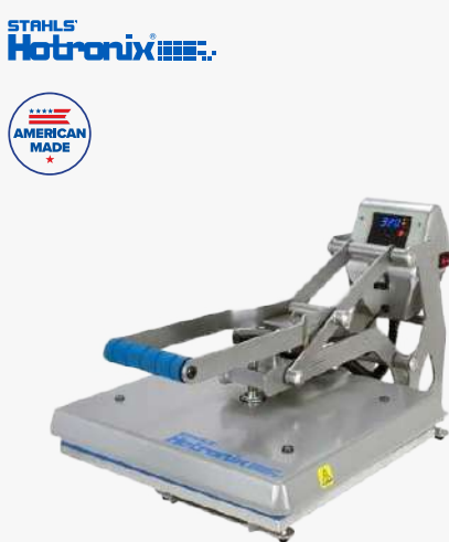
STX16 Auto Open 16" x 16" HANDS-FREE DESIGN DURABLE & RELIABLE QUICK CHANGE PLATENS