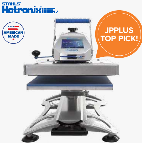
Fusion IQ® 16” x 20”