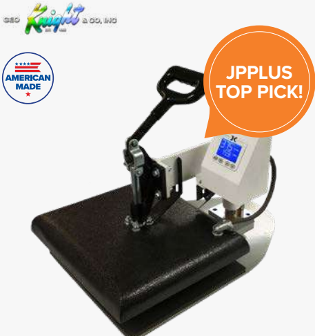
DK14S 12” x 14”

BEST SELLER COMPACT & PORTABLE EVEN PRESSURE & HEATING