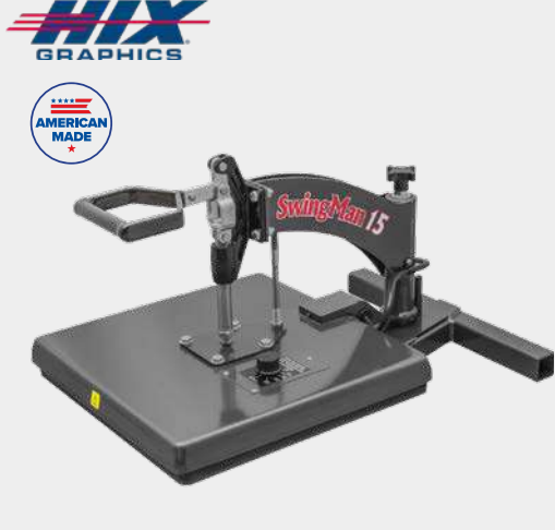
SwingMan 15 15” x 15”

PORTABLE FOR EVENTS ENTRY LEVEL EVEN PRESSURE & HEATING