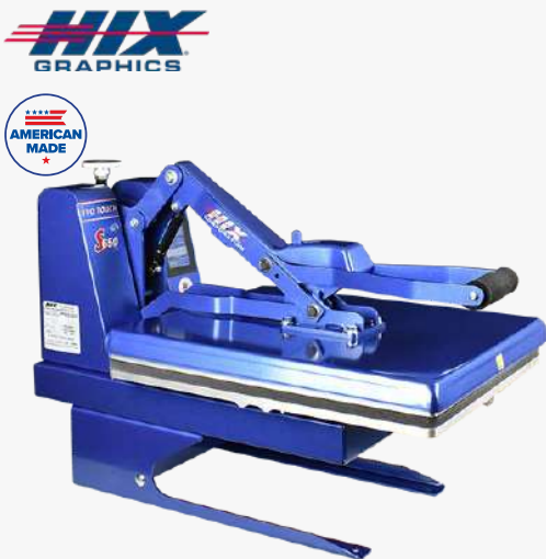
Evo Pro 16" x 20" EVEN PRESSURE & HEATING AUTO RELEASE DIGITAL CONTROLS