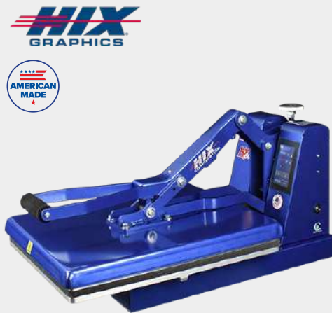
HT-600 16" x 20" EVEN PRESSURE & HEATING AUTO RELEASE DIGITAL CONTROLS