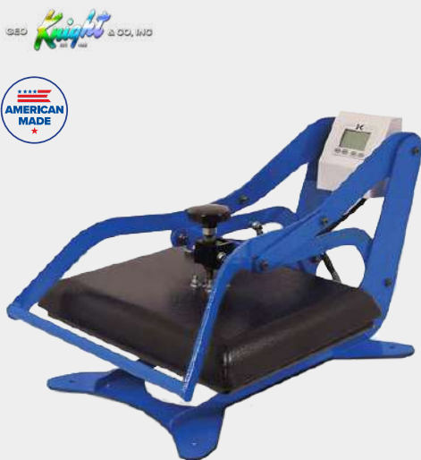
DK16 14" x 16" HEAVY DUTY DURABLE & RELIABLE SUPER PORTABLE