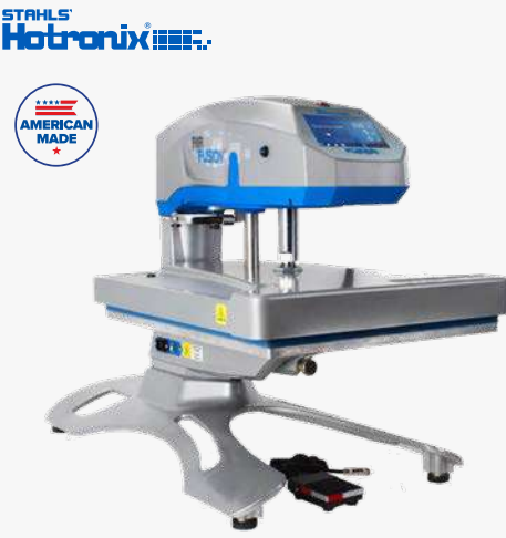
Air Fusion IQ® 16” x 20”

EVEN PRESSURE & HEATING AUTOMATIC PRESS AUTO-ADJUST PRESSURE