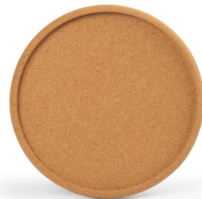
11.75" Circular Cork Tray Item # - CT13