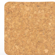
4" x 4" Square Cork Coaster