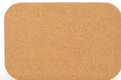
Rectangular Cork Cutting Board