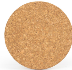
6.6" Circular Cork Trivet Item # - CT11