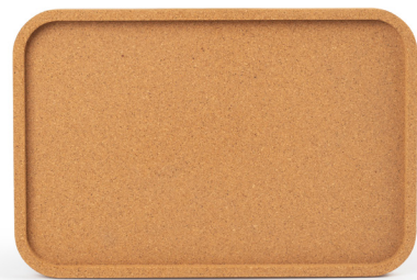
Rectangular Cork Tray 11.75" x 8.8" | Item # - CT12