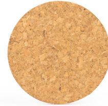
4" Circular Cork Coaster