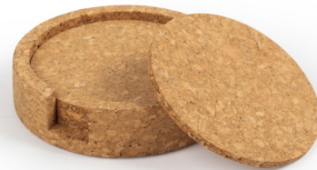
4/PKG Circular Cork Coaster Set